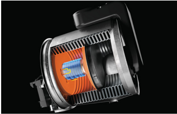
Low-emission, Viessmann-made Matrix Plus cylinder burner

The proprietary Viessmann modulating Lambda Pro Plus combustion control offers clean combustion, 10:1 turn down ratio and quiet operation with either propane or natural gas, which can be changed at the push of a button.