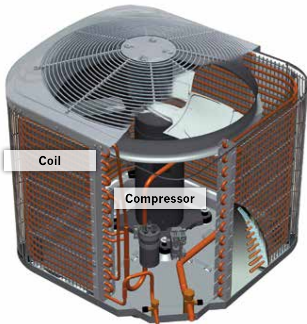
Comfort™ 16 Air Conditioner Shown

* Upon timely registration. The warranty period is five years if not registered within 90 days of installation. Wi-Fi® is a registered trademark of the Wi-Fi Alliance Corporation.